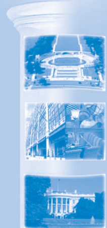
Renaissance Hotel, Washington, D.C.