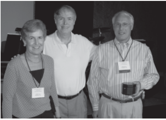
PHOTO HIGHLIGHTS OF THE 2008 ANNUAL MEETING