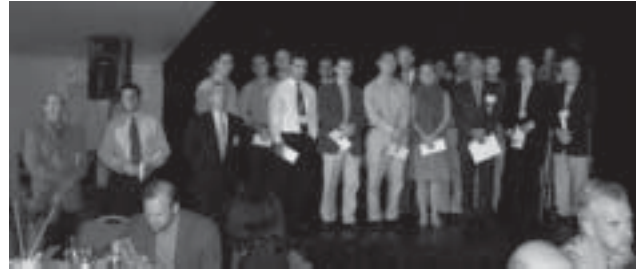
Resident Travel Award Winners