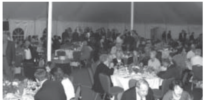
Friday night "LaDiva" entertainment