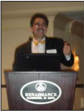
PHOTO HIGHLIGHTS OF THE 2009 ANNUAL MEETING September 24-27, Washington, DC