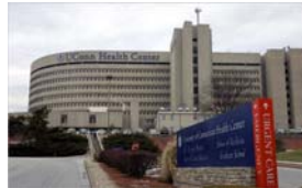
Established in 1975